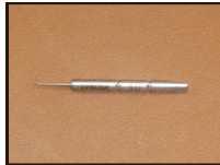
Iron of removable round awl 10 mm