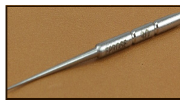
Iron of removable round awl 30 mm