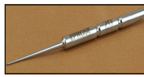
Iron of removable round awl 20 mm