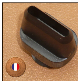
Oblong hollow punch 11 x 2.5 Réf. 300-EPO-112