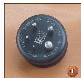
Clear away the waste for round hollow punches Réf. 300-cde-000