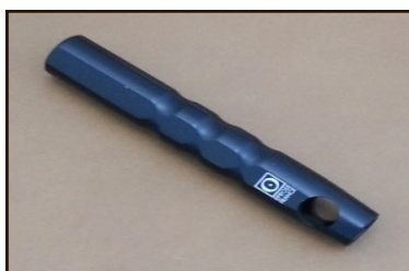
Handle for round and oblong hollow punches Réf. 300-EPM-018