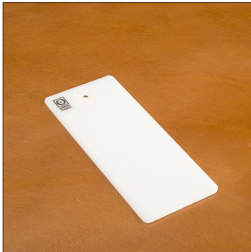
Plate to Enture in PE HD, thickness 3 mm to use as a cutting support. Plate to cut the thread on the sewing machine or on the workstation. It avoid damaging the blade's sharpening. Hole diameter 6 mm to suspend your plate.